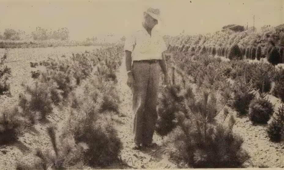
Pinus strobus . White pine. (left) Picea excelsa . Norway spruce. (right) Photo Sept. 1954

PICEA rubra, alba, pungens . Few each. 1½-2' ----- $1.50 2-2½' ----- $2.50